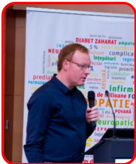
Frank Bowling UK