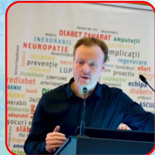
Frank Bowling UK